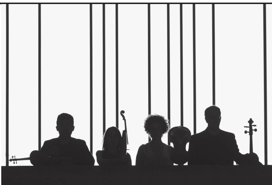
Image of the Verona Quartet from their website