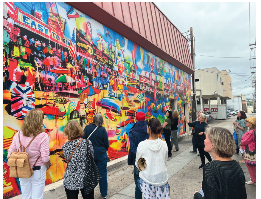
Walking tour at Ocean Front Property in Arizona (2022) by Rosson Crow.

Because the murals are all on view outside and accessible at any time, self-guided tours are also available. A map of Murals of La Jolla and a self-guided tour document can be found at the webpage listed above. It is also possible to sign up for a Murals of La Jolla membership, which includes a membership to the Athenaeum. For further information, please visit muralsoflajolla.com .