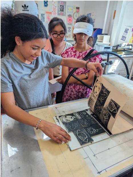
Students from Barrio Logan College Institute visit the Print Studio.

At the Athenaeum Art Center in Logan Heights a rich tapestry of events is set to unfold, offering a vibrant celebration of art and culture. The upcoming schedule includes an array of experiences.